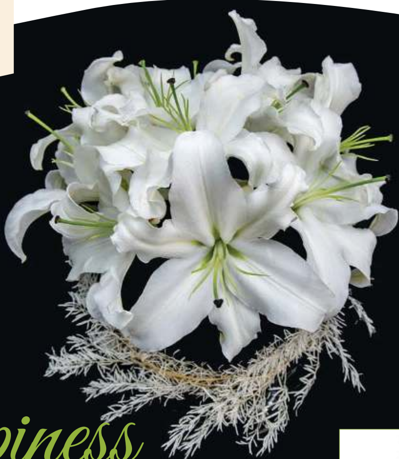
Designer: Richard Go AIFD

Contrast a tower of black floral foam with dazzling white for a heavenly result.