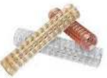
OASIS® Floral Mesh Roll Product code: Copper SKU: 40-13112 Gold SKU: 40-13110 Silver SKU: 40-13111 Size: W: 35cm x L: 5 metres Pack quantity: 1 roll