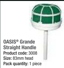
OASIS® Grande Straight Handle Product code: 3008 Size: 83mm head Pack quantity: 1 piece