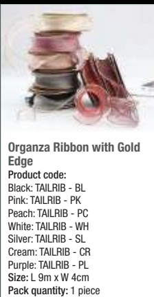
Organza Ribbon with Gold Edge Product code: Black: TAILRIB - BL Pink: TAILRIB - PK Peach: TAILRIB - PC White: TAILRIB - WH Silver: TAILRIB - SL Cream: TAILRIB - CR Purple: TAILRIB - PL Size: L 9m x W 4cm Pack quantity: 1 piece

All products available at www.oasisfloral.com.au