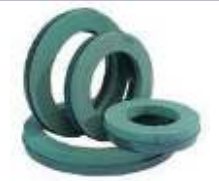
OASIS® NAYLORBASE® Ring Product code: 4509 Size: 36cm (14") Pack quantity: 2 pieces

gaps leaving at least 30cm strips at one end of the mesh.