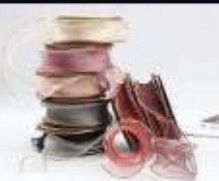
Organza Ribbon with Gold Edge Product code: Black: TAILRIB - BL Pink: TAILRIB - PK Peach: TAILRIB - PC White: TAILRIB - WH Silver: TAILRIB - SL Cream: TAILRIB - CR Purple: TAILRIB - PL Size: L 9m x W 4cm Pack quantity: 1 piece

Step 2. Roll the organza 'Mat' to the same circumference as the OASIS® NAYLORBASE® Ring then secure the ends with a 22 gauge florist wire. Soak the Ring before placing on top of the Wire Mesh container.